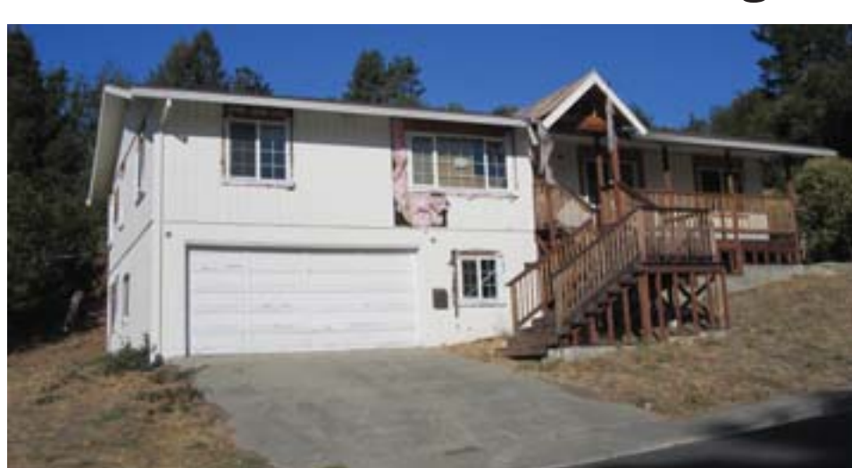
A state of disrepair at 90 Greenfield Dr.